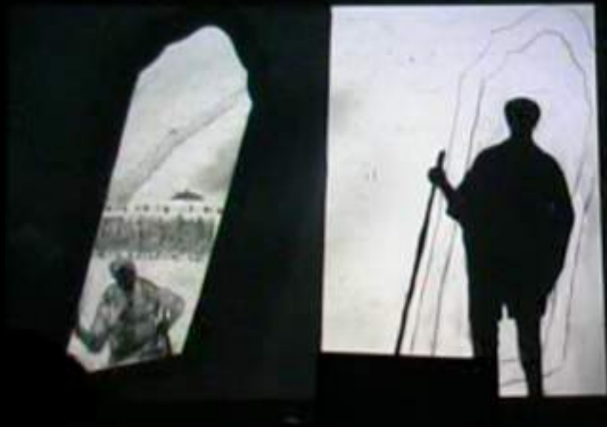
Hold De Door, 3'3"8, 2008