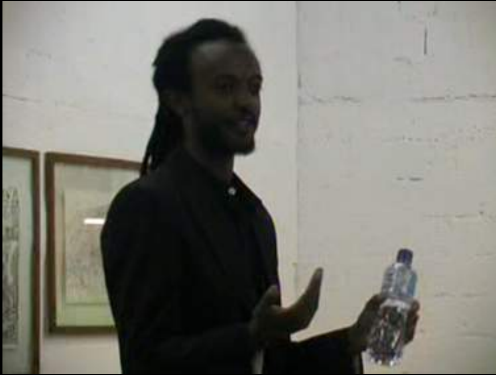
Event video/recorded by Yared Zeleke & Mekonnen Mengiste

The presentation is structured around the notion of MEMORY & PROCESS which is used to understand the artist's work as well as the context in which it will be screened.