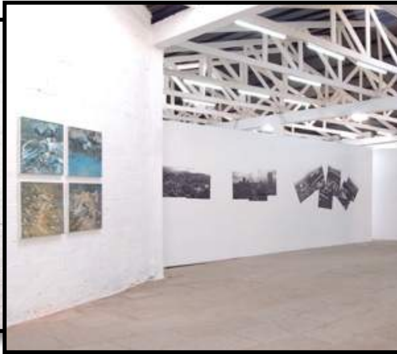
Spread Stones I-IV, Oil on canvas, 2010, Tewodros Hagos