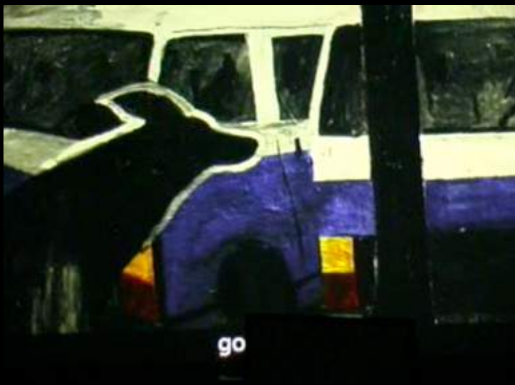
Hisab, 7'49", 2011