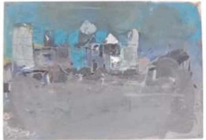
Blue Trains, Mixed media on carton, 1993, Mulugeta Tafesse