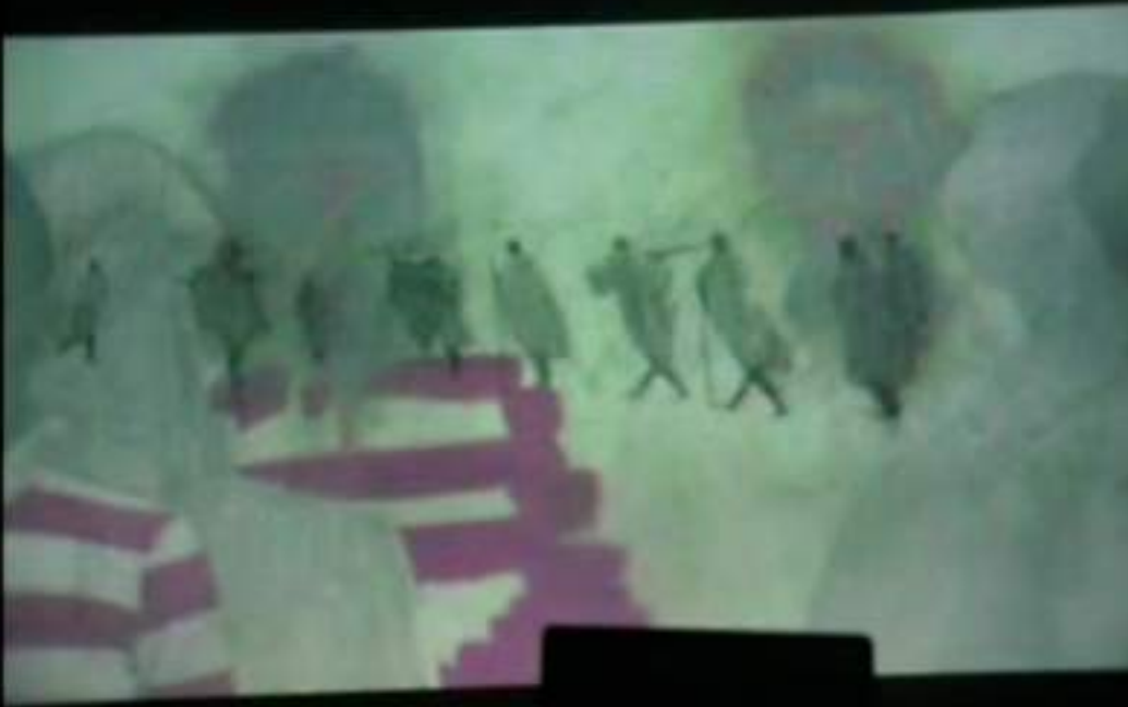
When We All Met, 3'54"