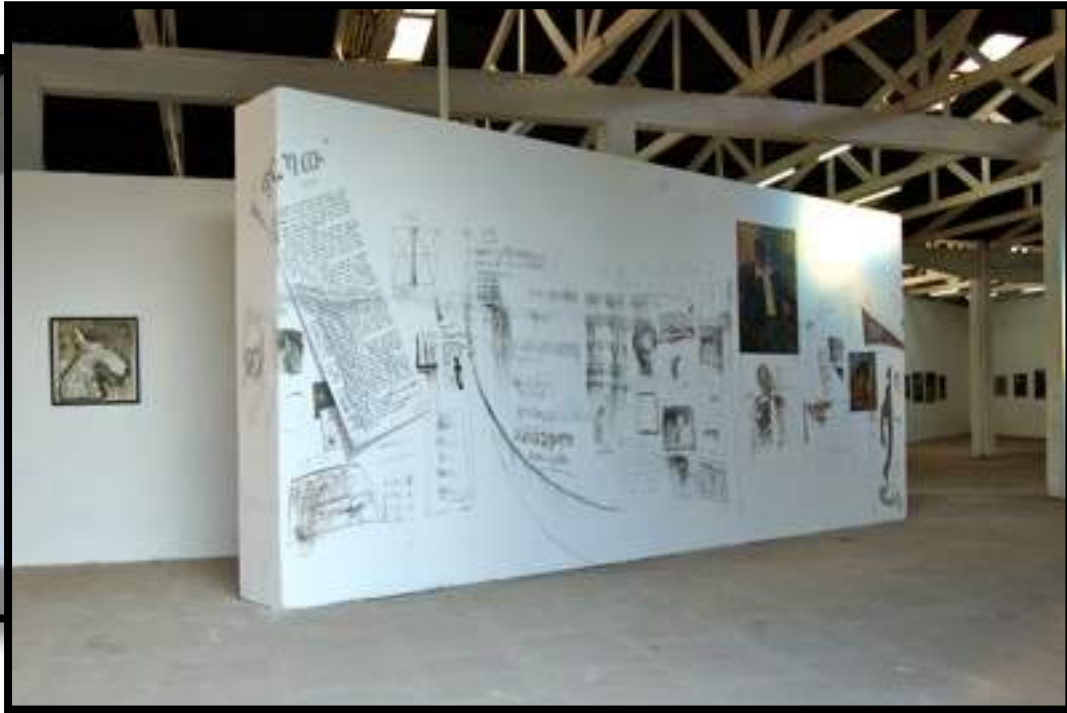
Hidden Secret, Mixed media, 2010, Klaus Mertens Birds, Woodcut, 2000, Klaus Mertens