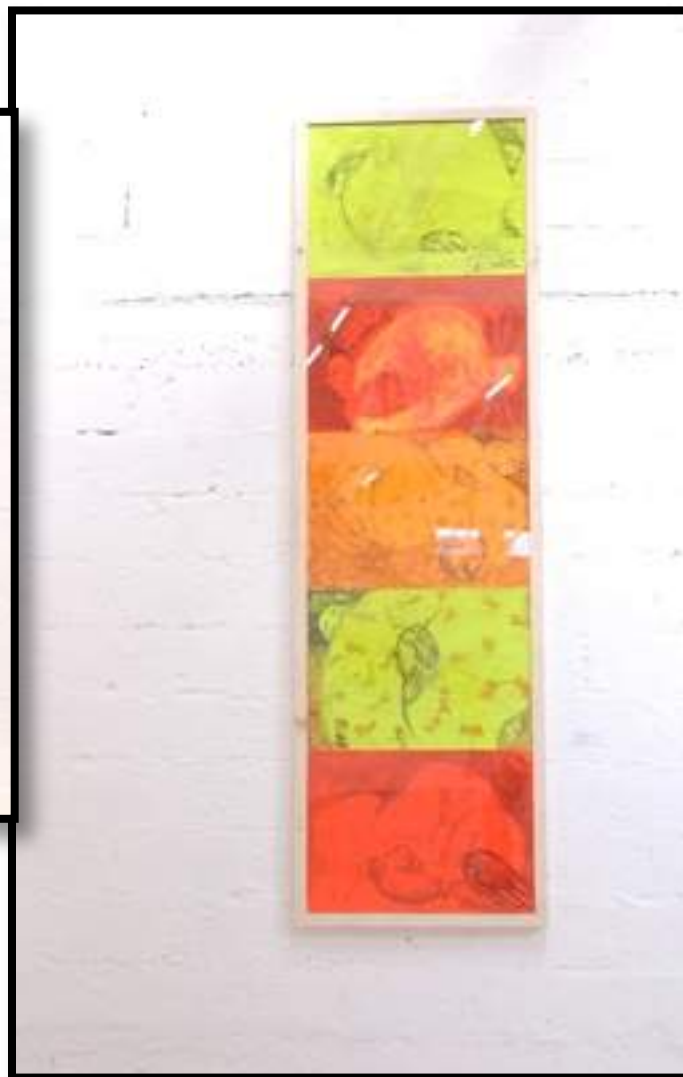
Night & Dream, Ink on fluorescent sticker, 2010, Bisrat Shibabaw