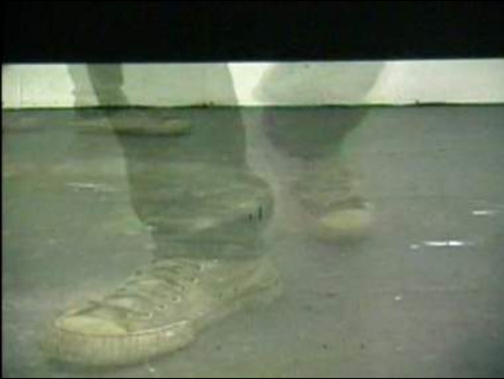
Sweep Walk, 1'2", 2007