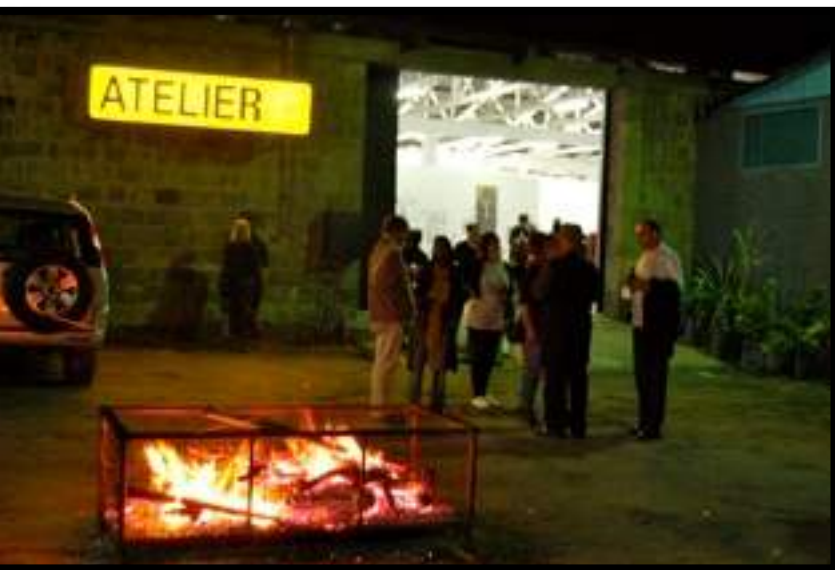
NEOSCAPE Opening Night January 29, 2011