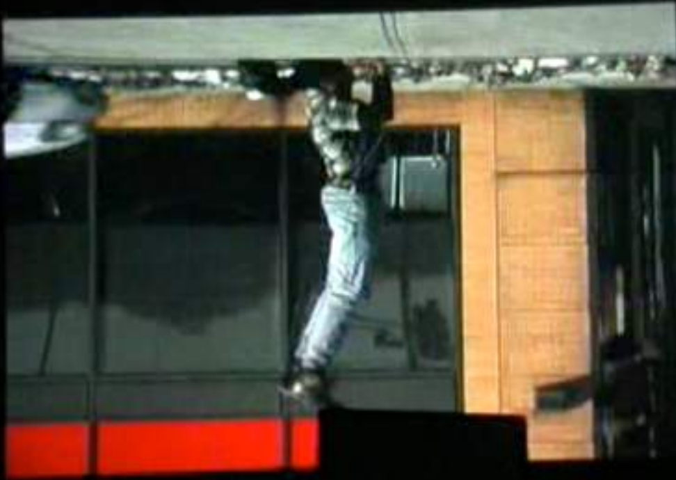
Head Stance, 2'29", 2007