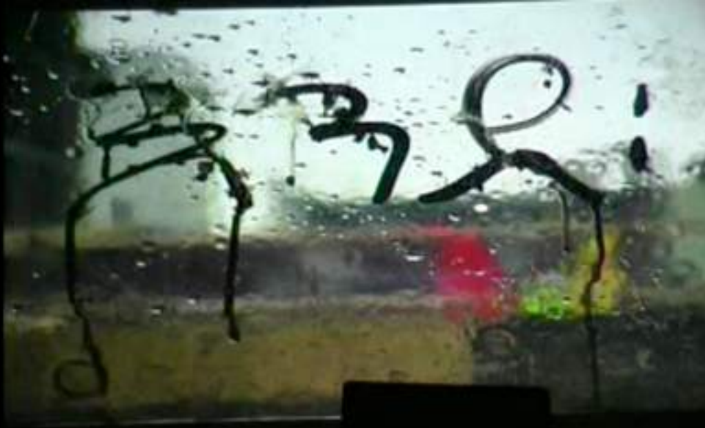
Amora, 2'40", 2009