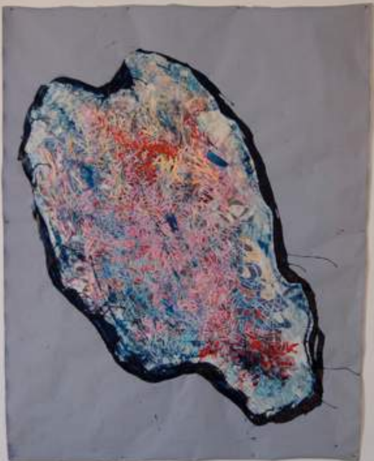
Untitled I Mixed media on paper 2010 Eyob Kitaba