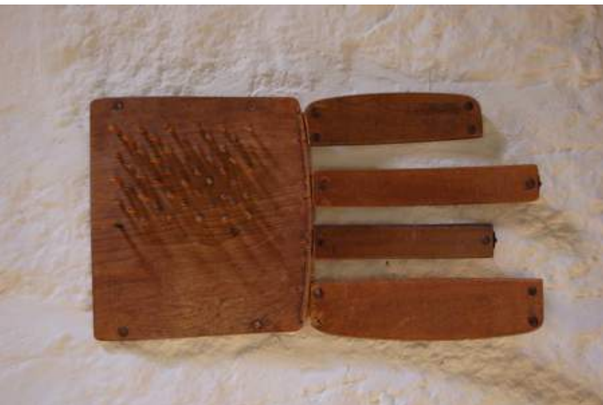
Flag Mixed Media 2008 Behailu Bezabih