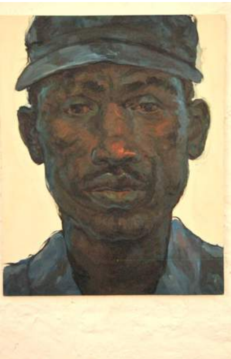
Federal Police Oil on canvas 2010 Tewodros Hagos