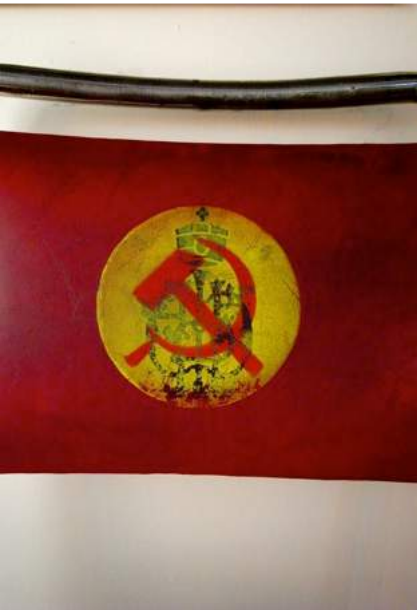
Past/Forward Photographic print Addis Ababa, 2008 Aida Muluneh